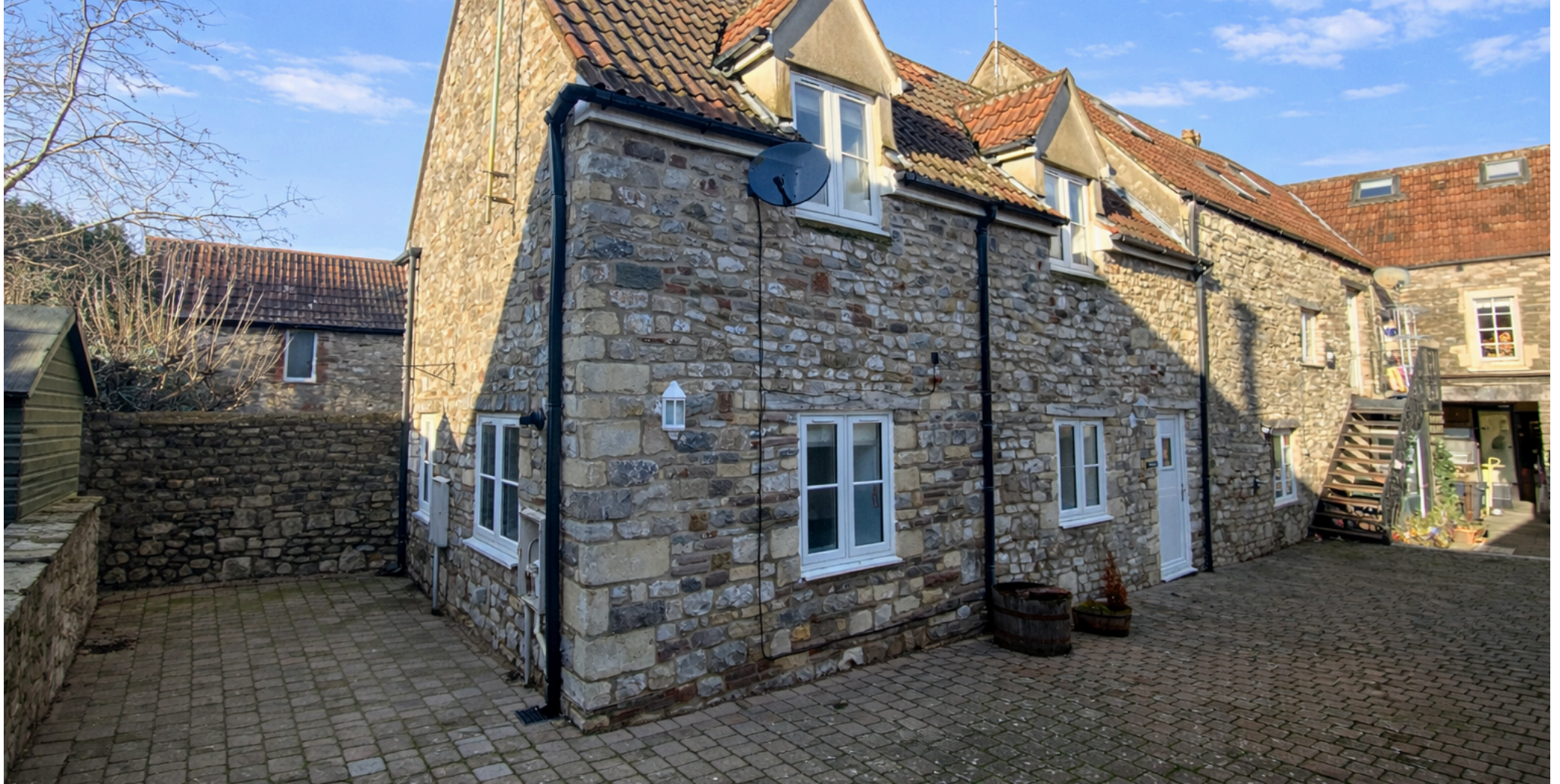
The Cottage, 58 Broad Street, Chipping Sodbury, BS37 6AG